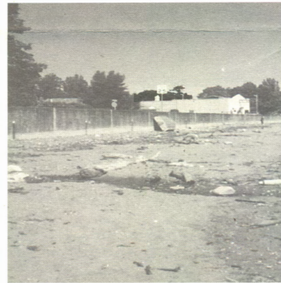
Panoramic view of Maple Beach today.

Michael cleared the land and built the first bulkhead along Maple Beach. The Ellet Report, filed in 1904 with the