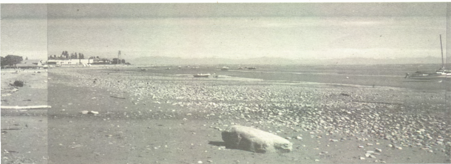
the end of the beach in the distance is the border station.