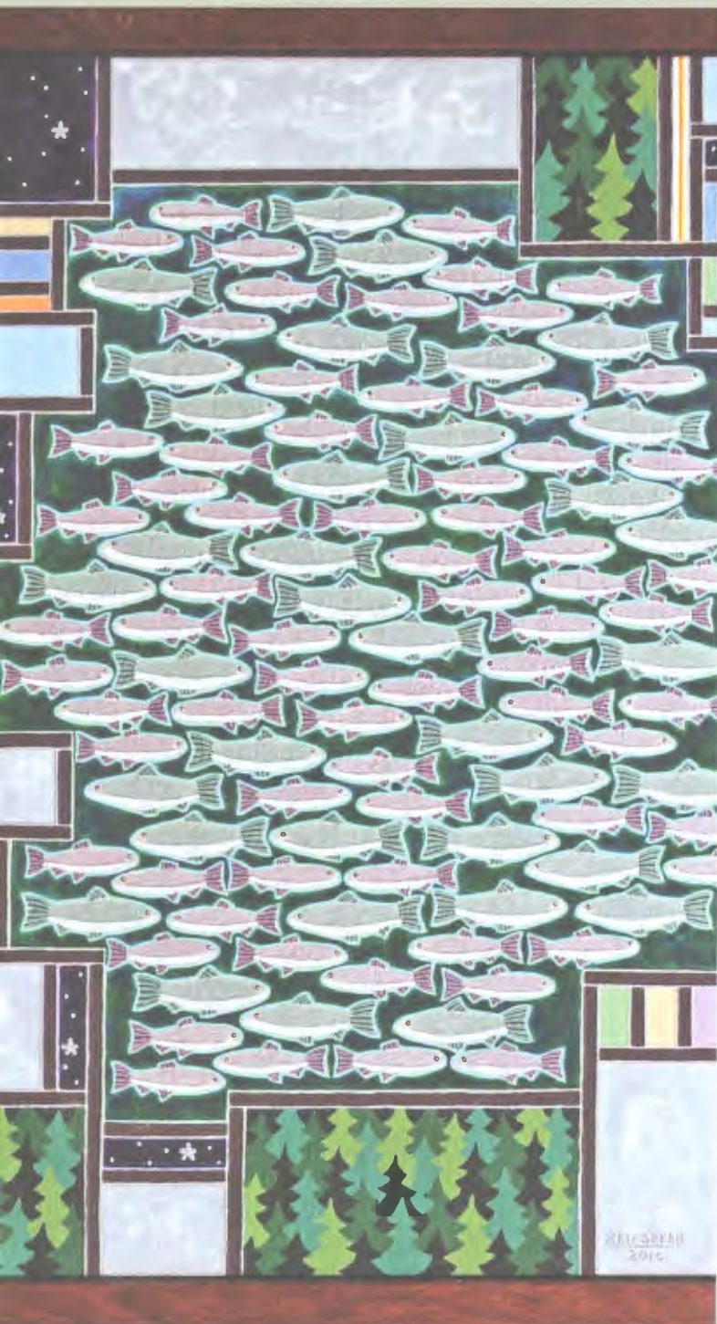
Northwest Neoplastic Salmon Mantra, Ken Speer